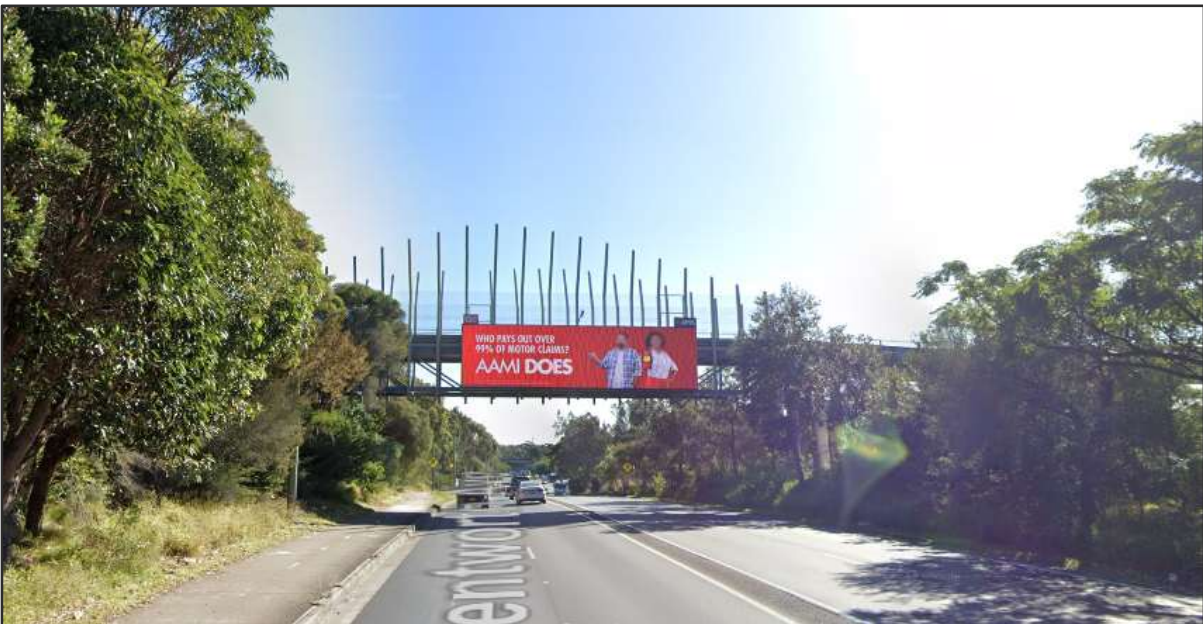
Figure 3: View of sign facing North West (source: Nearmap 2024)