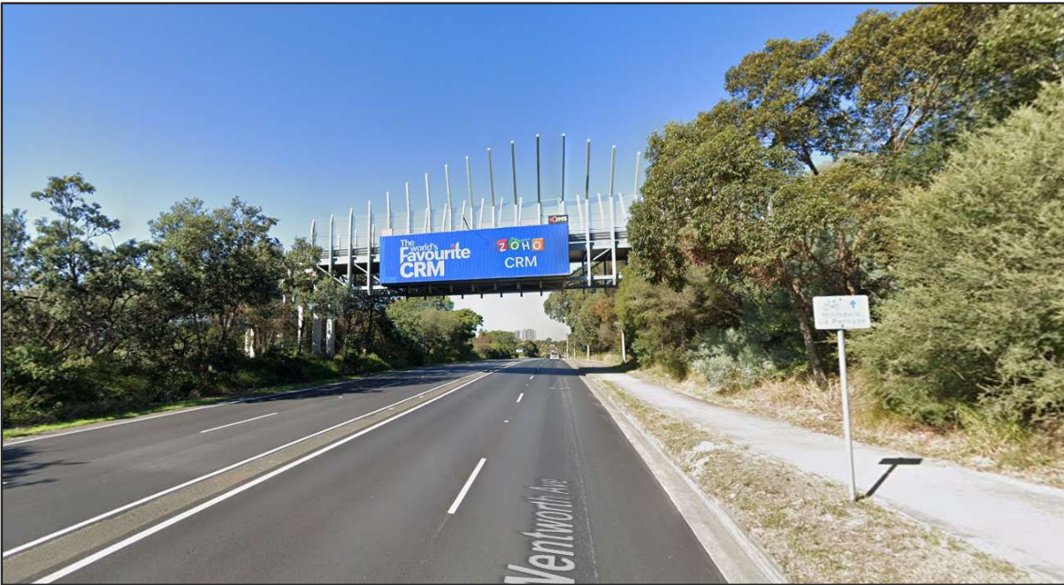
Figure 2: View of sign facing South East